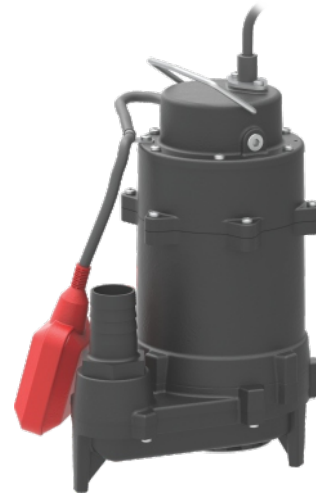
Submersible drainage pump with Wide angle float switch

Note : The above shown performance is nominal performance and may vary from pump to pump.